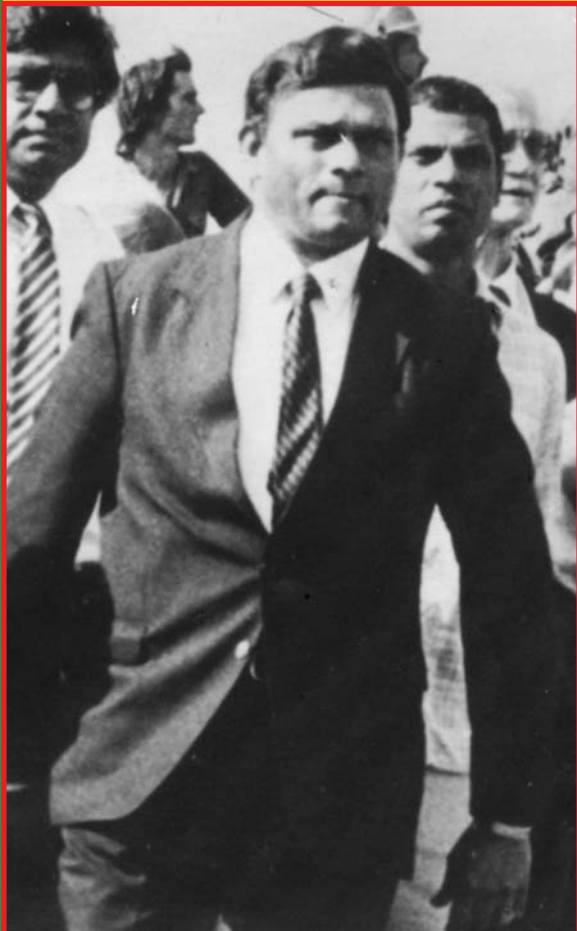
Amichand Rajbansi in action during Inanda riots