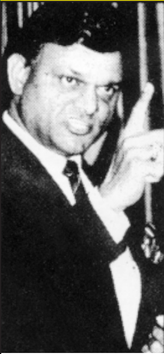
Amichand Rajbansi Man of courage and Charisma - Real Fighter

THE TENACIOUS FIGHTER WITH GUTS, WHO REALLY FIGHTS BACK